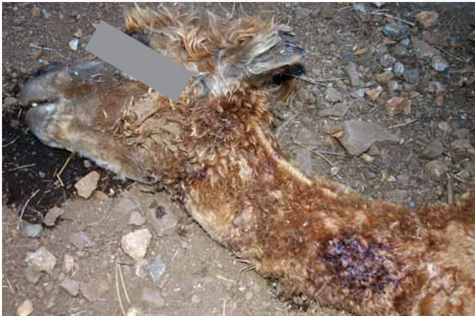
This alpaca was victim of a mountain lion attack. Note the mountain lion trademark bite (round in shape) to the neck. In this case the alpaca's ear was also torn. Most of the alpacas suffered only one bite to the neck. This attack resulted in five victimized alpacas and only one was partially eaten. Mountain lions sometimes kill over and over again as rapidly as they can, when they attack livestock in a fenced area. Wild life biologists call the phenomenon surplus-killing. The worst case on record is the loss of 192 sheep in a single night.

been a few well-publicized incidents involving mountain lions killing people since 1986, but the odds of this happening to you rate far below the odds of succumbing to a bee sting, lightning strike, snake bite, drowning or dog attack. From 1991 to 2003 the average death rate per year in California was .2. With Canada and the rest of the US added to this statistic the number of deaths to humans rises to about 0.8. Still an extremely rare occurrence, considering the number of people frequenting mountain lion habitats. In California