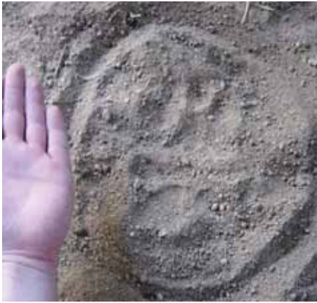
This footprint was found in the barn in the catch area where most of the alpacas were killed. This mountain lion was unusually bold to enter a doorway into an enclosed structure. The foot print is more than 4 inches across indicating a large mountain lion did the killing.