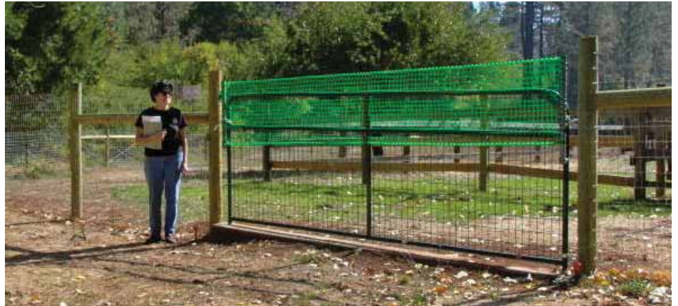
The five-foot no-climb fence around the pasture where five alpacas were killed was carefully constructed to keep out dogs and coyotes. The gates were modified to be the height of the fence and cement strips were poured under each gate to prevent a predator from pushing under a gate. The base on the entire perimeter had been reinforced with two strands of barbed wire. The animal control officer responding to the mountain lion attack noted that "the fence was more than adequate," but a mountain lion can jump a six-foot fence while carrying an animal in it's mouth. Mountains are capable of jumping twenty feet horizontally or vertically.

idiosyncratic mountain lion behavior usually involves sheep or goats – and now alpacas. Dog packs also have been known to indulge in surplus killing.