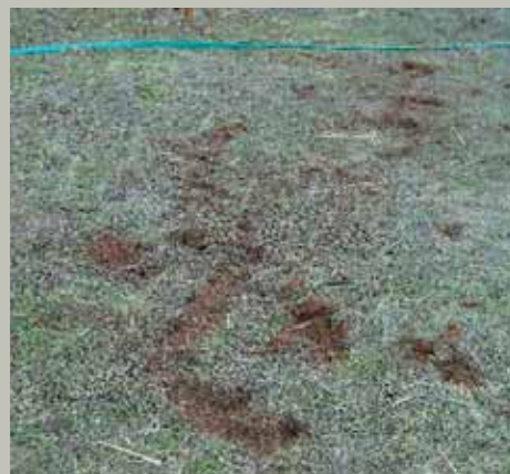
The ground around most of the slain alpacas was barely disturbed, indicating the cat was fast and efficient in running down its victims. However, the ground in this picture tells of a violent struggle by an alpaca that fought off its attacker. There are more than twenty deep gouges in the soil made up of mountain lion and alpaca footprints.

There was one notable exception. Judging by the paw prints and ground clearly disturbed by an alpaca's distinct cloven hooves, the predator and victim had struggled violently. This alpaca had fought loose and run quite a distance from the mayhem. As far as the cat knew this is the one that got away. In the