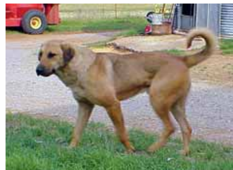
If mountain lions are preying on livestock locking the livestock up at night in a covered shelter may be warranted. Livestock guard dogs, such as the Komondors (left) and the Anatolian shepherd (right), also may help, but if you opt for the use of dogs, two is the minimum. A single dog may also become a victim.

herd. The lion seems to sense there's too much risk and will retreat.