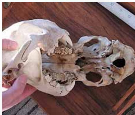
The tale of two skulls. A mountain lion skull is placed over a deer skull, showing how well a mountain lion's dentition is designed for a swift, powerful, and penetrating bite to the neck of its prey. The second skull in this photo is from a deer, the most common victim of a mountain lion attack.

Imagine a grid with one animal per square. When territories are occupied there is general stability in the system.