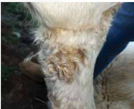
A telltale sign of cougar attack: a surgical-like bite to the upper neck

The animal control officer noted the fence was more than adequate, compared to most livestock operations in the area. The professionally installed five-foot high perimeter fence made of t-bar and heavy gauge no-climb wire, with a dog-proof base and reinforced gates had