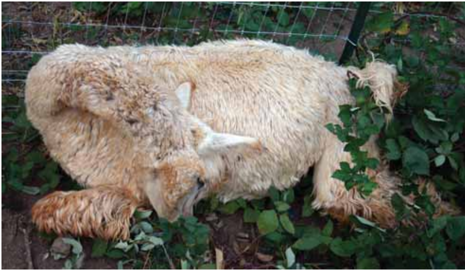
This is the alpaca who broke free the mountain lion's grip and ran from the site where the rest of her pasture mates were found killed. Unfortunately, she had been fatally wounded by a bite to her neck before she broke free. She had enough control in her final moments to kush along a fence with her tail flipped forward in final gesture of submission.

around chewing on an ear, and left the area without sampling it's other victims.