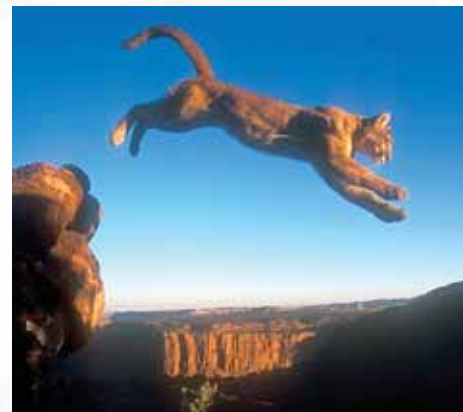
Mountain lions are amongst the most athletic cats in the world. They can leap 20 feet vertically and can clear 30 feet on a horizontal surface. They have the agility of a small cat and the strength of a leopard. They are a stealth predator preferring stalking cover to get close to their prey before leaping on it. Though most mountain lions leave livestock alone, some seek out livestock. There are approximately 10,000 mountain lions living in Oregon and California and many healthy populations in much of Canada and west of the Mississippi River in the U.S.

A man who once owned a mountain lion thought an eight to ten foot fence that angled out at the top two to three feet would keep a puma out. “They need to climb and if they bump into something at the top this should deter them.” Others thought double fencing with each fence height being six feet or higher might be an effective deterrent. This would create double barrier that interrupts stalking, throwing the puma off his game. Visual barriers were also suggested. It needs to be noted that none of these suggestions were seen as foolproof by the people suggesting them, nor did anyone want their suggestion attributed to them.